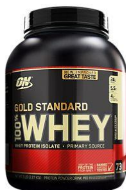
Optimum Nutrition Gold Standard 100% Whey Costco, Walmart, Vitamin Shoppe