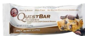
Quest Bar Vitamin Shoppee, GNC, Walmart, Safeway