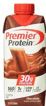
Premiere Protein Shake Costco, Sam's Club, Target, Walmart