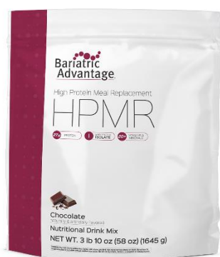
Bariatric Advantage High Protein Meal Replacement Queen's POB 1 Pharmacy

To prepare, mix one scoop powder with 8-12 ounces of water. Use a whisk or shaker bottle.