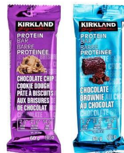
Kirkland Protein Bar Costco