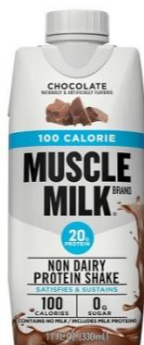
Muscle Milk LIGHT Costco, Target, Walmart, Safeway